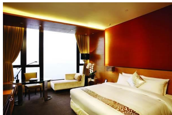
Comfortable standard guest room of The T Hotel with beautiful scenery